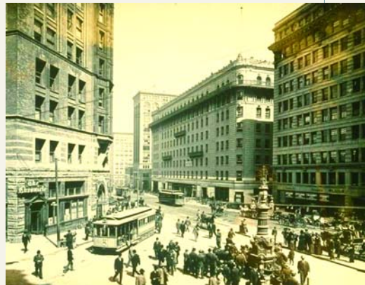
This photo was taken three years after the 1906 earthquake. Looking from Kearny Street facing Market Street east; from left: Chronicle Building, Palace Hotel and Monadnock Building.

Thanks in large part to the generous sponsorship of Sonnenschein, Nath and Rosenthal, the price for admission is free, but you must sign up in advance. Bring your families to this fun-filled out-door event. Let's have a lot of fun, meet up with old friends, meet new friends and kick off the 2003 ABA Annual Meeting with a bang (not including dynamite, of course). A wide variety of hors d'oeuvres will be available, as well as wine, beer and other refreshments.